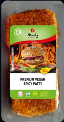
Premium Vegan Spicy Patty 200 g

A spicy, savoury Tex-Mex style burger patty with plenty of red bell pepper, and all the upsides of a vegan burger - an ethical choice for animal welfare as well as the entire planet.