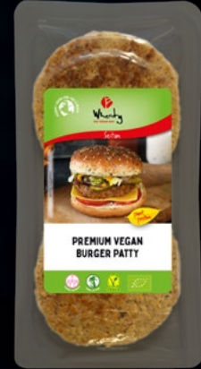
Premium Vegan Burger Patty 200 g

This is the best vegan burger on the market, hands down. These patties do not cut any corners: they feel as firm and juicy as the original. 100% organic and satisfyingly delicious.